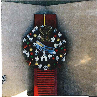
2018 First Place Winner Bear Waste/Bear Wash