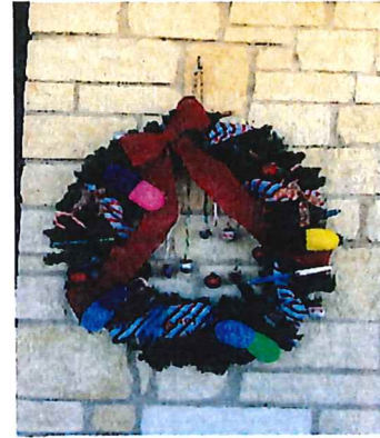
2018 Third Place Winner Lifecheck